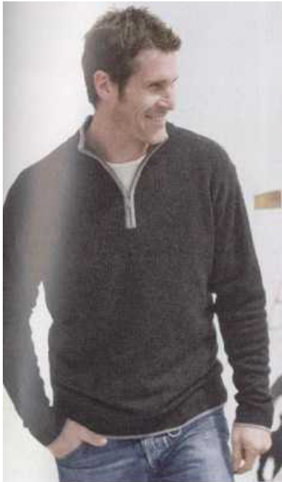
CHARCOAL / FLANNEL GREY