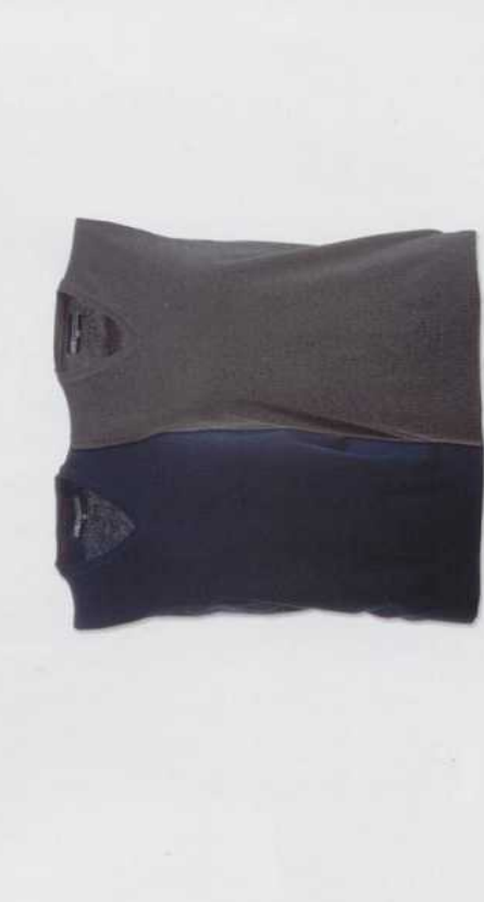
Bleu Navy Gris Cendré

Pull homme col en «V» avec décollété, manchettes et bords inférieurs à côtes fines, fabrication rasé fin et façonnage sans coutures apparentes. Matériau: 90% coton 10% lana prélavé Poids: 280gr - Tailles: Casual Fit S-M-L-XL-XXL (3XL Bleu navy) - Emballage: 20pcs