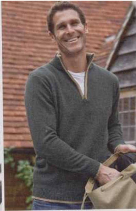
TWEED GREEN / CAMEL