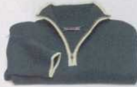
BOTTLE GREEN / PISTACHIO