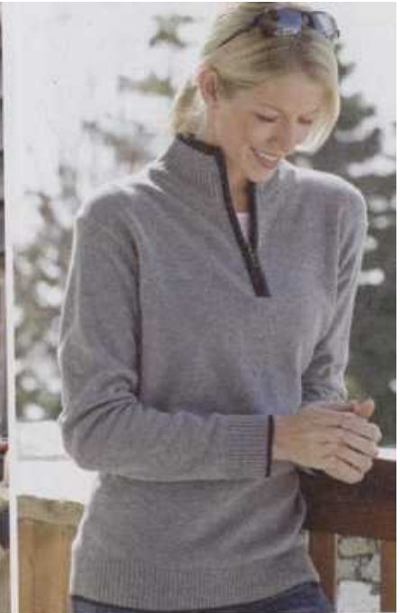
FLANNEL GREY / CHARCOAL