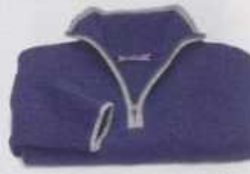
MARINE / FLANNEL GREY