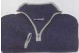
NAVY / FLANNEL GREY

S: Width 20" Length 26" / M: Width 22" Length 27" L: Width 24" Length 28" / XL: Width 26" Length 29"