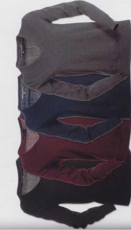
Noir Bordeaux Bleu Navy Gris Cendré

Gilet femme col en «V» avec décollété et bords inférieurs à côtes fines, fabrication rasé fin et façonnage sans coutures apparentes. Matériau: 90% coton 10% lana prélavé Poids: 280gr - Tailles: Casual Fit S-M-L (XL-XXL Bleu navy) - Emballage: 20pcs