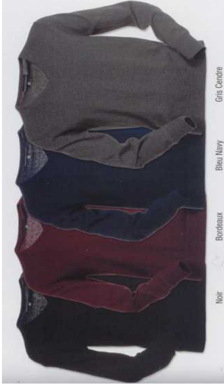
Noir Bordeaux Bleu Navy Gris Cendré

Gilet homme col en «V» avec décollété et bords inférieurs à côtes fines, fabrication rasé fin et façonnage sans coutures apparentes. Matériau: 90% coton 10% lana prélavé Poids: 280gr - Tailles: Casual Fit S-M-L-XL-XXL (3XL Bleu navy) - Emballage: 20pcs