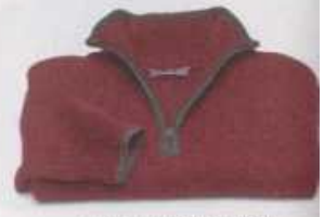
WINE / TWEED GREEN