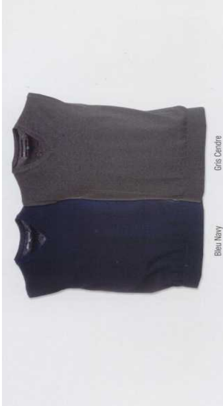
Bleu Navy Gris Cendré